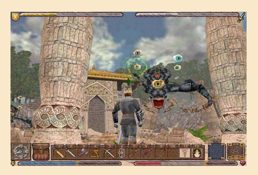
Illustration 3. An imaginary creature. Screenshot from Ultima 9 . © Origin Systems

Fantasy role-playing games, on the other hand, require different skills from the translator. He or she must be able to employ deliberately archaic language, translate poems, songs and riddles, and be conversant with terminology from such fields as alchemy, heraldry and siege warfare. Most of all, the translator must be able to create names. Of course Tolkien set the standard here, naming hundreds of persons, species and places in ways that suggest much about them (think of the threatening, sonorous name "Mordor"). Translators will have to dig deep into myths, legends and fairy tales of the target language to recreate the linguistic experience of some of the best fantasy role-playing games.