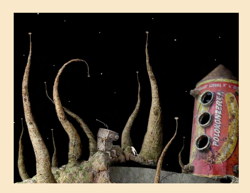
Illustration 1:An almost completely visual "casual game." Scene from Samorost 2

These are statements I have heard in one form or another from numerous translators, and they typify a widespread ignorance of games and condescension towards them. Besides these condescending attitudes towards games, there has been a culture gap between translators and gamers. Translators should recognize that games cover an enormous spectrum, from almost completely visual puzzle games to complex role-playing games containing hundreds of thousand of words, from quick coffee-break entertainment to huge sagas lasting hundreds of hours of playing time.